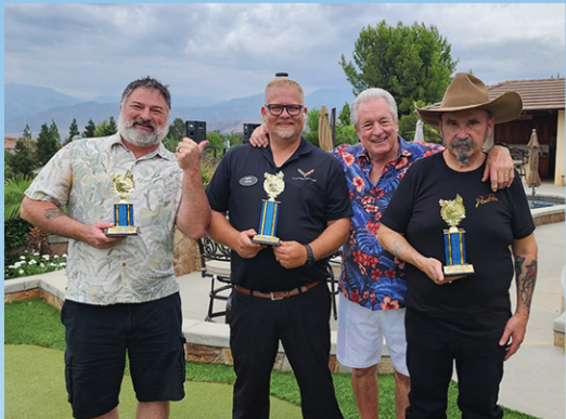
PUTTING CONTEST WINNERS