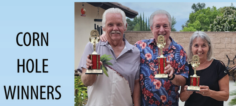
CORN HOLE WINNERS