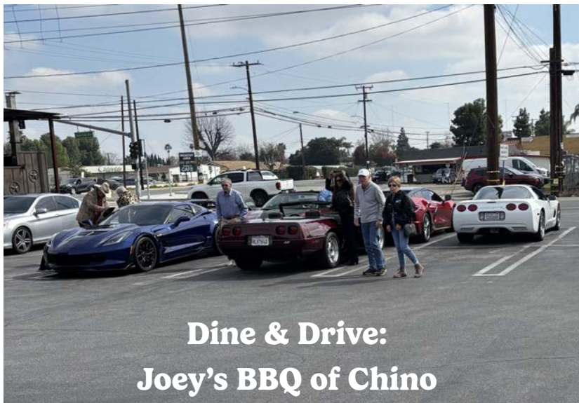
Dine & Drive: Joey's BBQ of Chino