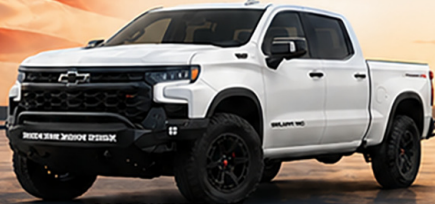
2026 CHEVROLET SILVERADO 1500