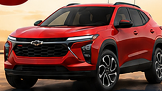
2026 CHEVROLET TRAX