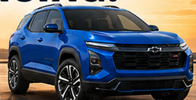
2026 CHEVROLET EQUINOX