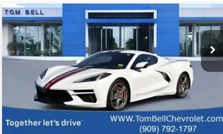
Used 2021 Chevrolet Corvette Stingray 3LT