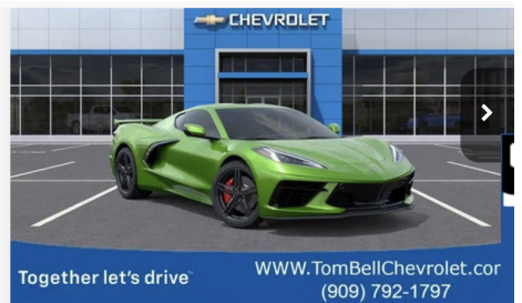
New 2026 Chevrolet Corvette Stingray 2LT