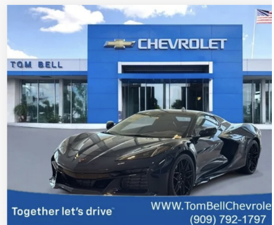
New 2025 Chevrolet Corvette Z06 2LZ