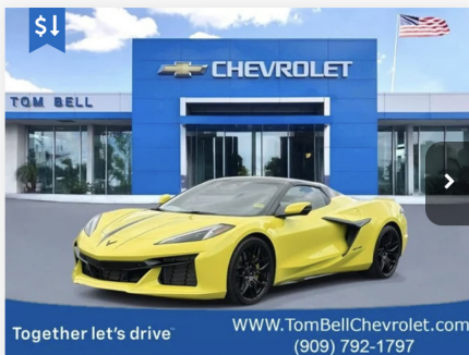
Used 2024 Chevrolet Corvette Z06 3LZ