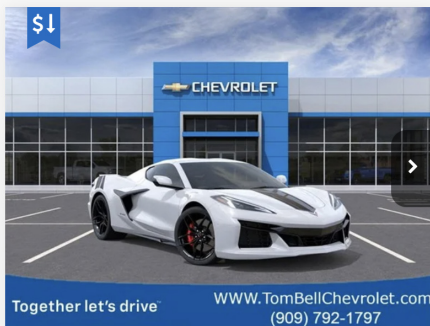
New 2025 Chevrolet Corvette Z06 3LZ