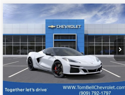
New 2026 Chevrolet Corvette E-Ray 2LZ