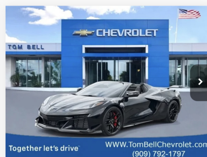
Used 2025 Chevrolet Corvette Z06 2LZ