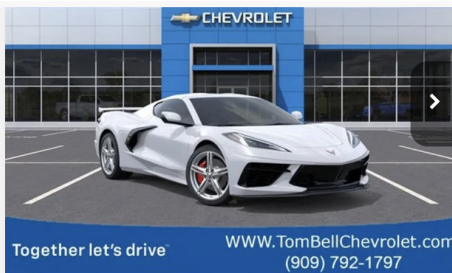
New 2026 Chevrolet Corvette Stingray 1LT